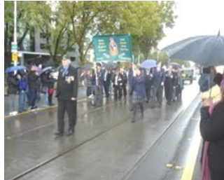
Victoria members on the march in the wet