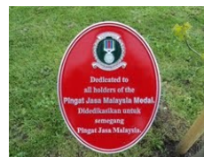
UK Memorial plaque