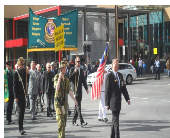
64 formed up behind the Banner