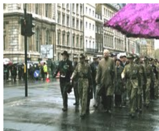
Australian and New Zealand on the march in London.