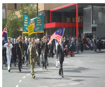
RAN Cadets were the national flag bearers and a Army Cadet carried the identification sign.