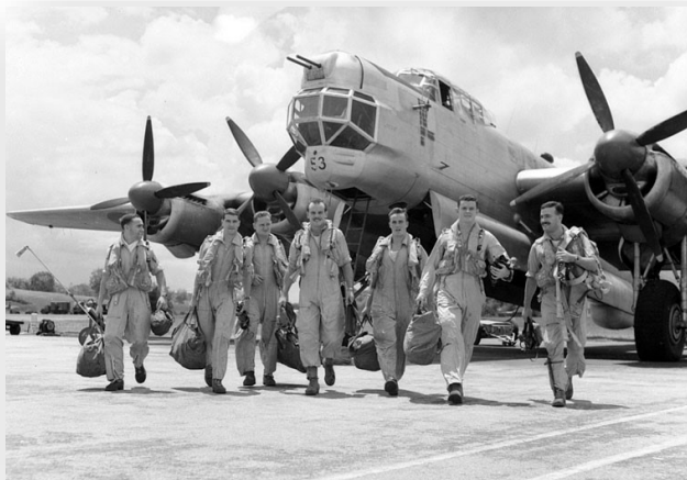
No. 1 Squadron flying crew leaving their Lincoln bomber after a mission over Malaya.

These pilots gave of their time for us and we will always be grateful for that it topped of the best service one could hope for. Respect for those lost was as it should be a high honour to them.