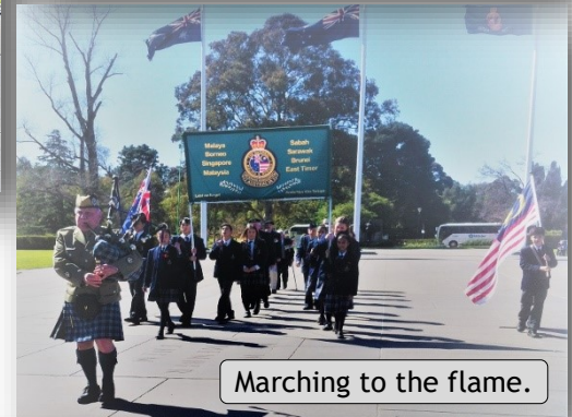
Marching to the flame.