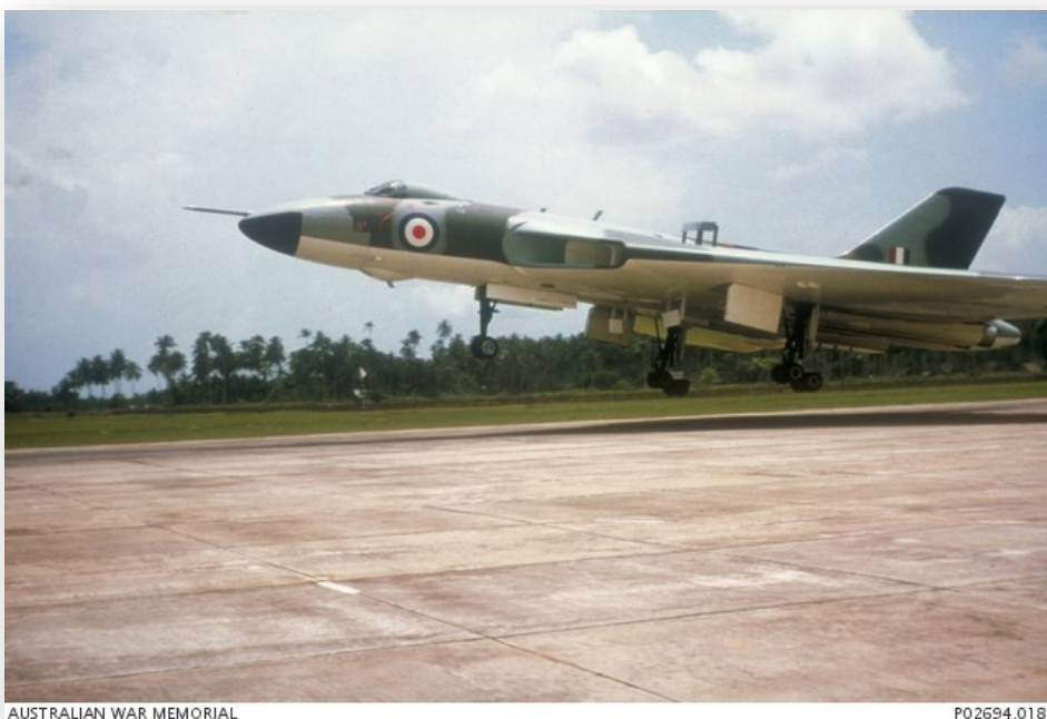
RAF Avro Vulcan bomber lands at RAF Butterworth, Malaysia , c 1965. The presence of these strategic bombers was a considerable deterrent to the Indonesians during the Confrontation period.

Bendigo was the location for 2017 with a trip to the Murray River and paddle steamer ride to a winery incorporated into the three-day event. Members of 21 Construction Squadron who also served in Sabah out of Puckapunyal also join our group to socialise reminisce.