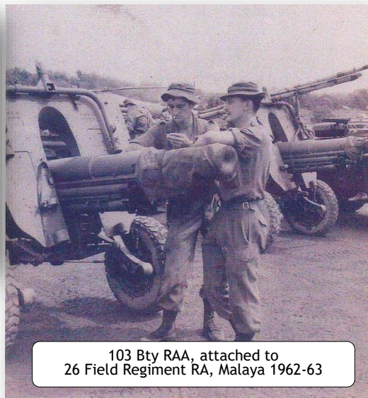
103 Bty RAA, attached to 26 Field Regiment RA, Malaya 1962-63