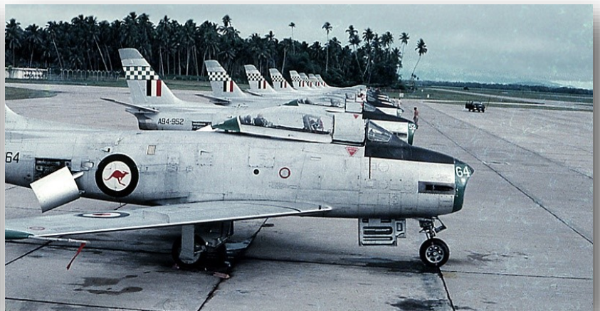
No. 77 Squadron RAAF Sabres lined up on the tarmac at Butterworth in 1960. The first Sabre operation of the Emergency took place on 13 August 1959 when pilots dive-bombed communist camps and supply dumps near the Thai-Malay border. By the time Australian Sabres arrived, however, the Emergency was all but over and their operational role was limited.